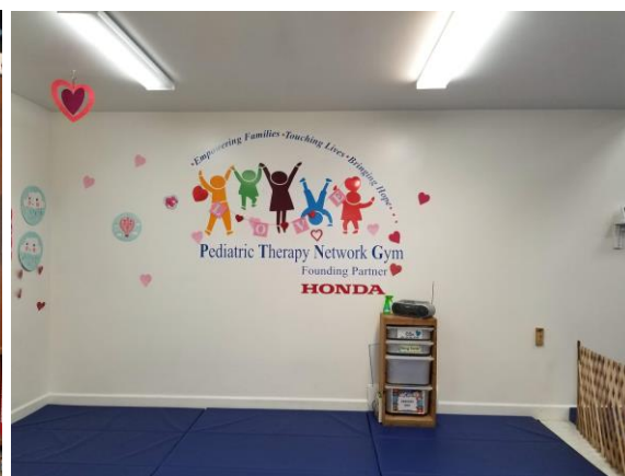
Pediatric Therapy Network Gym