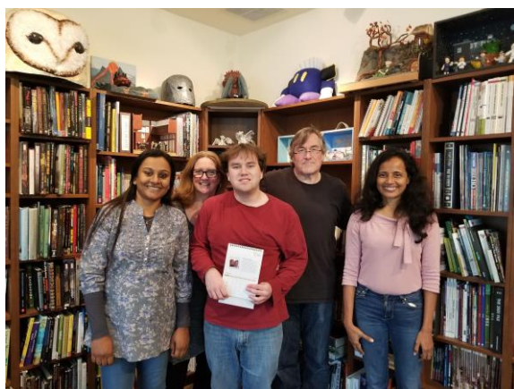
At Autistry Studios, San Rafael, California